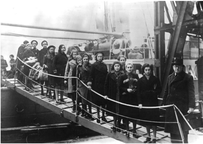
The children of Polish Jews from the region between Germany and Poland on their arrival in London on the “Warsaw”. February 1939 (iv) .

The Kindertransport , or children’s transport, was “the informal name of a series of rescue efforts which brought thousands of refugee Jewish children to Great Britain from Nazi Germany between 1938 and 1940” ( The Holocaust Encyclopedia ) (ii) . Wikipedia says; “The United Kingdom took in nearly 10,000 predominantly Jewish children from Nazi Germany, Austria, Czechoslovakia and Poland, and the Free City of Danzig. The children were placed in British foster homes, hostels, schools and farms. Often they were the only members of their families who survived the Holocaust” (iii) .