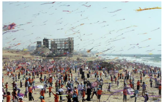
On 30 July 2009 children in Gaza created a new world record for the number of kites flying simultaneously in the same place (vi)

Let this flying kite take back the sky for me (v) .