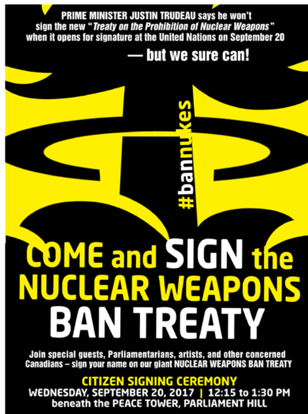
Draft Poster for Ottawa's Sept. 20 #bannukes event

There are reports that this stance weakens Canada's chances of getting a seat at the UN Security Council. But the real problem is preventing nuclear war. Former Senator Doug Roche reminds us that "the majority of nations now agree that the faulty doctrine of nuclear deterrence must be replaced with a sincere desire to build a global security architecture without nuclear weapons." An Alberta Public Interest Research Group article points out that he was "equally critical of Russia and