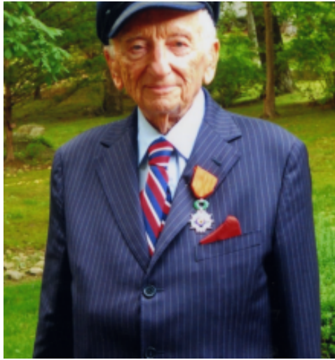
At 97, Benjamin Ferencz is still working to end war

CC board members were inspired by a story broadcast on CBC radio (March 21, 2017). In 1947, Benjamin Ferencz was in Nuremberg as a 27-year-old war crimes prosecutor. He had witnessed the Nazi concentration camps, which led to his "determination that the real answer to the problem is to end war making." At the age of 97, he is still working towards that goal and played an instrumental role in developing the concept of the International Criminal Court. While he is discouraged by the waves of