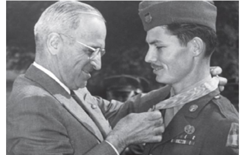
President Truman awarding Desmond T. Doss the Congressional Medal of Honor, Oct. 12, 1945

award-winning documentary, The Conscientious Objector , available on youtube, and in the book, The Unlikeliest Hero .